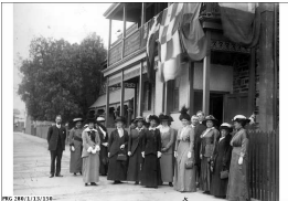
Lady Galway and others in Whitmore Square, Adelaide

Description: This image shows Lady Galways and a group of other women and men standing outside the Lady Victoria Buxton Girls' Club in Whitmore Square, Adelaide.