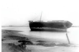
Boys Reformatory Hulk, Fitzjames

Description: This photo is undated, the date included is an estimate. This webpage is no longer in operation. This URL is taken from the wayback machine and is dated 12 March 2022.