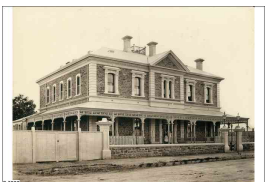
Gilbert Street, Adelaide

Description: This image shows the front of The Bridge Rescue Home, Adelaide. One person can be seen on the verandah of the Home.