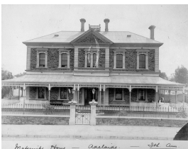
Maternity Home - Adelaide - Sth. Aus.

Description: This image shows the front of The Bridge Rescue Home, Adelaide. One person can be seen on the verandah of the Home.