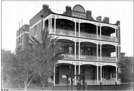
Angas Street, Adelaide

Description: The library description states: Angas Street, Adelaide, south side, on March 1922 showing the Salvation Army Women's Hostel soon after its opening in early March. Frontage: 16 yards. Left side is 20 yards west of James Street. Right side is 145 yards east of Hutt Street.