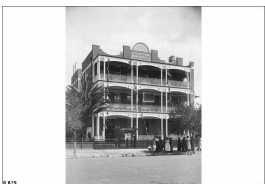
Angas Street, Adelaide, South Side

Description: The library description states: Angas Street, south side, showing the Salvation Army Women's Hostel. Left side is 20 yards west of James Street. Right side is 145 yards east of Hutt Street.