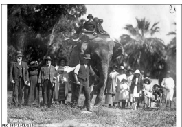
Elephant ride at Adelaide Zoo

Description: The library description states: Residents of Estcourt House, the James Brown Home for aged, blind, and crippled children, with Mary the Elephant during a day trip to the Adelaide Zoo on 27 November 1923.