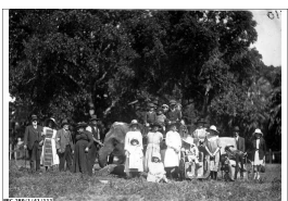
Elephant ride at Adelaide Zoo

Description: The library description states: Residents of Estcourt House, the James Brown Home for aged, blind, and crippled children, with Mary the Elephant during a day trip to the Adelaide Zoo on 27 November 1923.