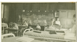
Estcourt House - Interior dormitory

Description: The library description states: Children from Estcourt House at Grange enjoying an outing at Adelaide Zoo; six small boys are riding on the back of an elephant which is resting on the grass with its Keeper standing by its head, adults and other children, two being in wheelchairs, stand in front.