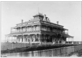
Estcourt House, Grange

Description: This image of Estcourt House shows adults and children who lived in the Home standing on the verandah.