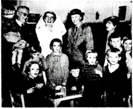
Lady Norrie Opens Red Cross Home At Henley

Description: This is a copy of an image illustrating an article in The News, 'Of interest to women' on 16 August 1933, on page 8. The caption states: The Junior Red Cross Home at Henley Beach, which is now completed, looks over the trees to the sea at the front, and from the back commands an unbroken view of the hills.