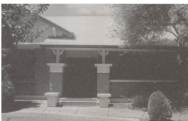
Former Wiltja Hostel 2005

Description: This image was included in Finding Your Own Way, Section 9.