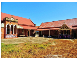
The Boys Town Chapel and Hall

Description: This is an image from the former site of St John's Boys Town and St John the Baptist Home for Boys.