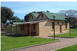
Glandore Industrial Home/Children's Home

Description: This photo is undated, the date included is an estimate. This webpage is no longer in operation. this URL is taken from the wayback machine and is dated 11 February 2019.