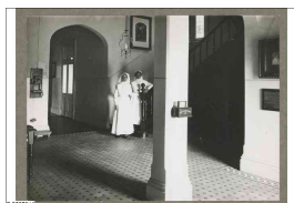
Queen's Home, Rose Park

Description: The library description states: A side view of the Queen's Home, Rose Park, building, with a number of nurses in the surrounding garden.