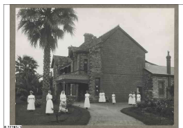
Queen's Home, Rose Park

Description: The library description states: Nursing staff at the Queen's Home, Rose Park.