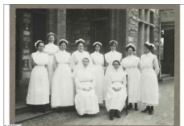
Nurses at Queen's Home

Description: The library description states: View of the front of Queen's Home, Rose Park, with a group of ten nurses on the first storey verandah.