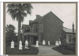
Queen's Home, Rose Park

Description: The library description states: Nursing staff at the Queen's Home, Rose Park.