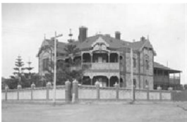
Largs Bay Orphanage

Description: This image was included in the Finding Your Own Way guide, Section 2. This photo is undated, the date included is an estimate.