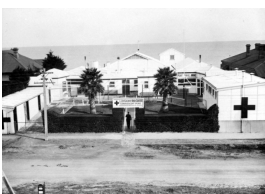
Adelaide, South Australia. A section of the Lady Galway Convalescent Home at Henley Beach.

Description: This is a copy of a photograph of the Lady Galway Convalescent Home for ex-servicemen in Henley Beach. In 1946, these premises became the Lady Hore-Ruthven Junior Red Cross Home.