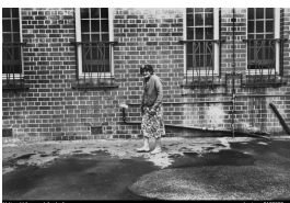
A woman standing barefoot outside Northfield Mental Hospital, South Australia