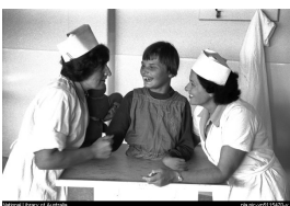
Two nurses with a young girl at Northfield Mental Hospital, South Australia