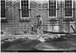
A woman standing barefoot outside Northfield Mental Hospital, South Australia