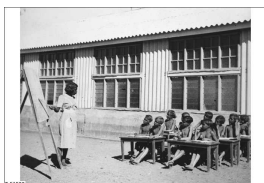
School at Ernabella Mission

Description: The library catalogue includes the description: A class of Aboriginal students and their teacher outside the school at Ernabella Mission.