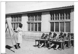
School at Ernabella Mission

Description: The library catalogue includes the description: A class of Aboriginal students and their teacher outside the school at Ernabella Mission.