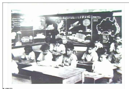
Mission, Swan Reach

Description: The library description states: Children in a classroom at the mission, Swan Reach.