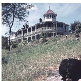
Mount Royal - Clarendon Children's Home

Description: The Church News published this photograph of Clarendon Children's Home at Mount Royal in their November 1945 edition on page 8.