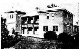
Ashley Home for Boys, main block

Description: This is an image of the main block of the Ashley Home for Boys. It was published with an article about a fire at the home in The Mercury on 23 May 1950. The description published with the photo reads "Ashley Home for Boys, Deloraine, the main block of which was gutted by fire yesterday. Damage is estimated at £30,000."