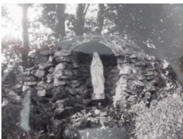
St Joseph's Waterton Hall grotto

Description: This image shows the grotto of Mary in the garden opposite the chapel at St Joseph's Waterton Hall.