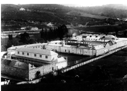
Female Factory Cascades from the east

Description: The photograph of the Female Factory Cascades, South Hobart, from the east is part of ER Pretyman's collection of photographs and glass plate negatives, 1880 - 1920