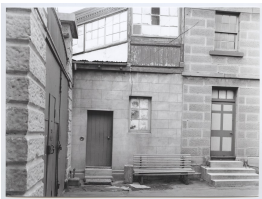
Campbell Street Gaol, Hobart - Exterior view of prison buildings