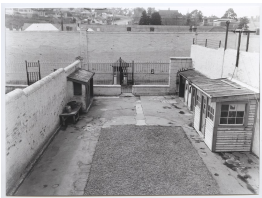
Campbell Street Gaol, Hobart - Courtyard view towards external wall and the Glebe