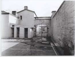
Campbell Street Gaol, Hobart - Internal courtyard showing outside wall, entry gates and outbuildings