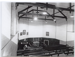
Campbell Street Gaol, Hobart - interior of chapel