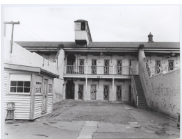
Campbell Street Gaol, Hobart - Cell Blocks and watchtower from external courtyard