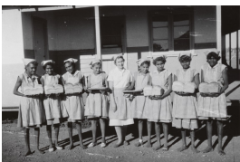
Karalundi Mission, September 1960, domestic science class

Description: This is a digitised copy of a still image and is part of the Portrait gallery, Volume 1, West Kimberley 1912 - South West 1960 series held at the State Library of Western Australia. The image shows girls from a domestic science class holding baked goods outside a building at the Karalundi Mission with their teacher.