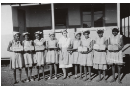
Karalundi Mission, September 1960, domestic science class

Description: This is a digitised copy of a still image and is part of the Portrait gallery, Volume 1, West Kimberley 1912 - South West 1960 series held at the State Library of Western Australia. The image shows girls from a domestic science class holding baked goods outside a building at the Karalundi Mission with their teacher.