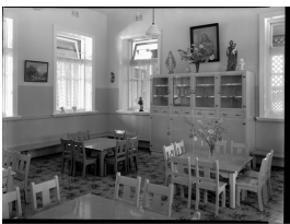
Table and chairs, St Joseph's Orphanage

Description: This is a digital copy of a photograph of the front entrance of St Joseph's Girl's Orphanage in 1953. It is from the State Library of Western Australia's collection of online images that were made available by the Historical Records Rescue Consortium Project supported by Lotterywest.