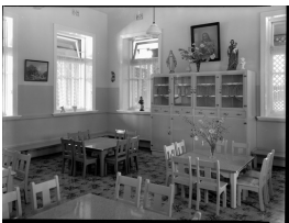
Table and chairs, St Joseph's Orphanage

Description: This is a digital copy of a photograph of the front entrance of St Joseph's Girl's Orphanage in 1953. It is from the State Library of Western Australia's collection of online images that were made available by the Historical Records Rescue Consortium Project supported by Lotterywest.