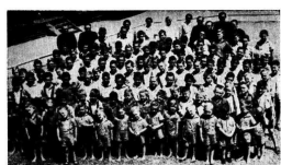
Young Australians. These boys are a few of those who are being cared for at the Salvation Army Boys' Home in Nedlands.