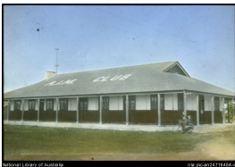
Australian Inland Mission Club House, Carnarvon, Western Australia [transparency]