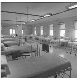
Ward at King Edward Memorial Hospital for Women, September 1969

Description: This is a digitised copy of negative and is part of the 'Stevenson, Kinder & Scott photograph collection' held at the State Library of Western Australia. The image shows an empty ward the the King Edward Memorial Hospital.