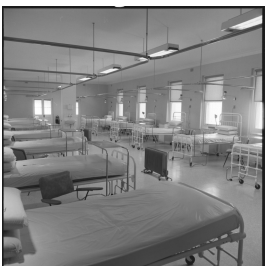
Ward at King Edward Memorial Hospital for Women, September 1969

Description: This is a digitised copy of negative and is part of the 'Stevenson, Kinder & Scott photograph collection' held at the State Library of Western Australia. The image shows an empty ward the the King Edward Memorial Hospital.