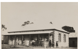
Stone Cottages, Carrolup Native Settlement, Western Australia

Description: This is an image of Carrolup in Western Australia. It shows a group of women and children standing in front of a large stone and brick cottage. Smaller timber buildings are visible in the background.