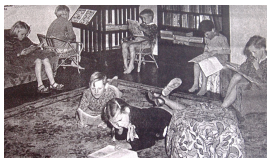
Group of children at Wanslea

Description: 'Wanslea Hostel (1943-1946) 30 Bulwer Street, in 2013' is a copy of a digital image from Google Street View, showing 30 Bulwer Street, the site of the former Wanslea Hostel (1943-1946).