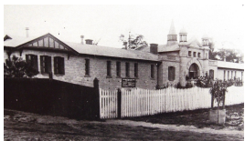
Government Industrial School Subiaco, 1900

Description: 'Government Industrial School Subiaco, 1900' is a digital copy of an image included (p.12) in the Annual Report 1979 of the Department for Community Welfare. It is part of a history of the department, written to celebrate 150 years of European settlement in Western Australia.