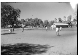
St Mary's Hostel, Alice Springs