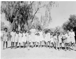
St Mary's Hostel - Matron in charge and children [altered from original title]