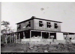
The Mission house, Groote Eylandt

Description: The description states: No. 1 Mission house, front view. It shows Angurugu Mission House, part of Groote Eylandt Mission.