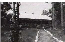
Angurugu Mission House

Description: This image shows the 'coconut avenue' and Mission House at Emerald River. It is not certain whether the building shown would have housed children in care on the Mission.