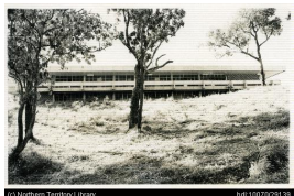
Kormilda College residential building

Description: This is a copy of a photograph from 1995. Its Northern Territory Library catalogue description is 'Kormilda College, old girls' dormitory'.