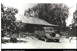
Griffiths House - building new boys dormitory

Description: Edited from the description: Griffiths House was built to accommodate children attending school in Alice Springs. Opened in 1941 as a service club.