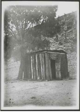
Jail at Heavitree Gap