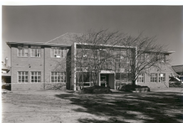
Royal Park Psychiatric Hospital - front view of Administration building looking south-west

Description: This is a photograph of the administration block at the Royal Park Psychiatric Hospital, also known as the Royal Park Mental Hospital. It shows a large, plain, rectangular brick building with a shallow porch jutting out over the central entrance. Older more decorative buildings can be seen on either side of the administration block. Two large trees stand directly in front of the building.