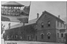
Ballarat Hospital for the Insane c1909 - Men's Ward

Description: This is an image of some of the women's wards at the Ballarat Hospital for the Insane, also known as the Ballarat Mental Hospital. It shows two buildings in Federation Queen Anne style, with decorated roofs and wide front verandahs. Two women dressed in white, possibly nurses, can be seen standing in front of one of the buildings. This image is part of a collage of photographs showing various aspects of the Ballarat Hospital for the Insane.