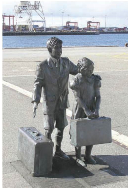
Child migrant memorial, Fremantle, 2006, courtesy of Australian National Maritime Museum and National Museums Liverpool 2010. More details: https://www.findandconnect.gov.au/ref/wa/objects/WD0001037.htm