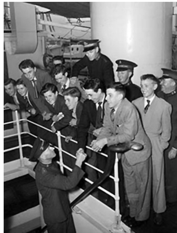
Immigration - Child migration schemes - Salvation Army Training farm, Riverview, Queensland, 1952