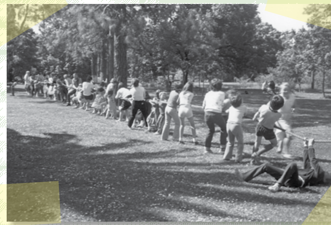
Tug of war in Princes Park, 1980s. Children, family and staff associated with St Joseph's Home for Children, Flemington. From the book, "Holding on to Hope" page 301.

Commonwealth Government introduces Supporting Mothers' Benefit.