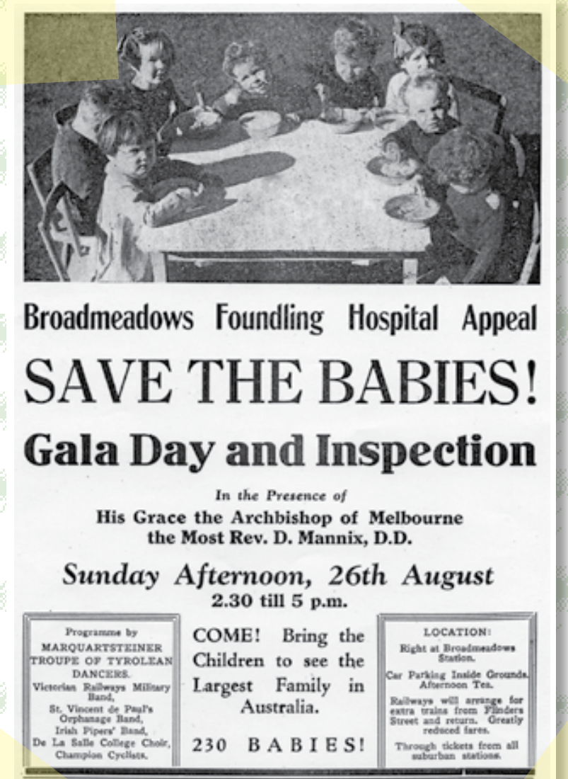
Gala Day and Inspection, St Joseph's Foundling Hospital, 26 August 1934. From the book, "Holding on to Hope" page 122

St Peter and St Paul's St Vincent de Paul Society Conference opens a rescue home for neglected children at 61 Nelson Road South Melbourne.