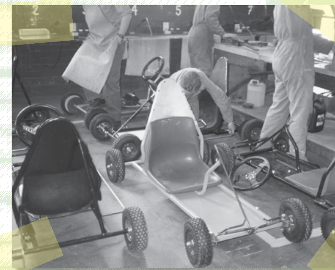
Go-cart workshop, New Street program, St Augustine's Adolescent and Family Service, early 1990s. The New Street program was designed to assist high-risk adolescents. It offered the opportunity for young people to make their own decisions and take responsibility for the outcome. From the book, "Holding on to Hope" page 305

Bringing Them Home: The Stolen Generation Report.