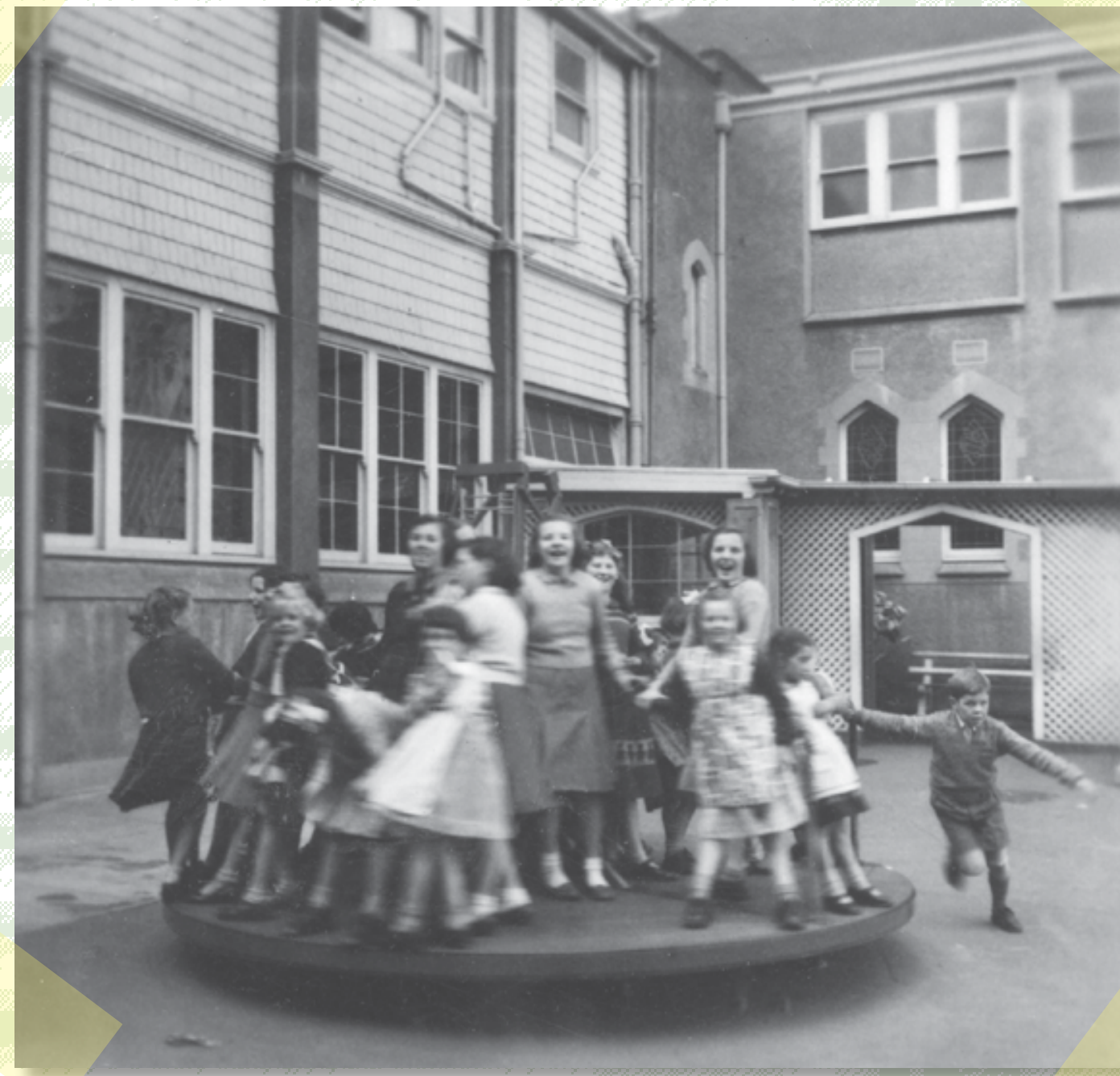
Children on a whirlingig, St Vincent de Paul's Girls' Orphanage, 1940s. From the book, "Holding on to Hope" page 185

Site is granted at South Melbourne for Melbourne Orphan Asylum.