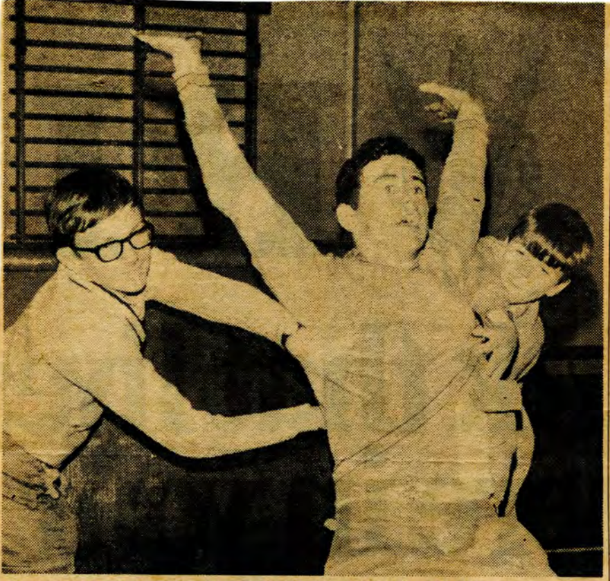
Boys at the Salvation Army Hollywood Children's Village practise leaping over a horse in the village gymnasium.